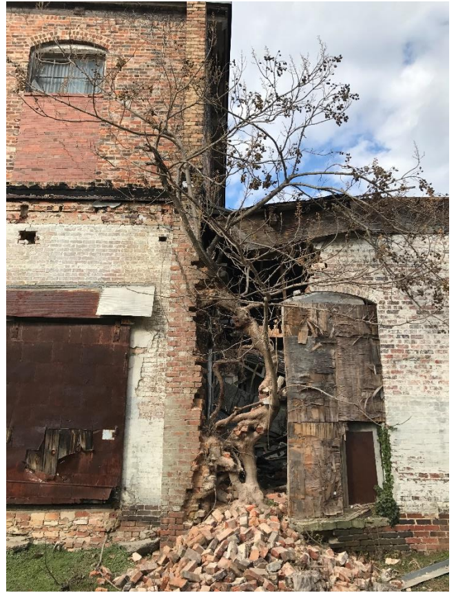
BrickTree named from this find in rear of Historic Eureka Mill prior to being restored.

BrickTree Brewing Company Grand Opening held July 24, 2020. They will Celebrate their Third Anniversary on July 24, 2023.