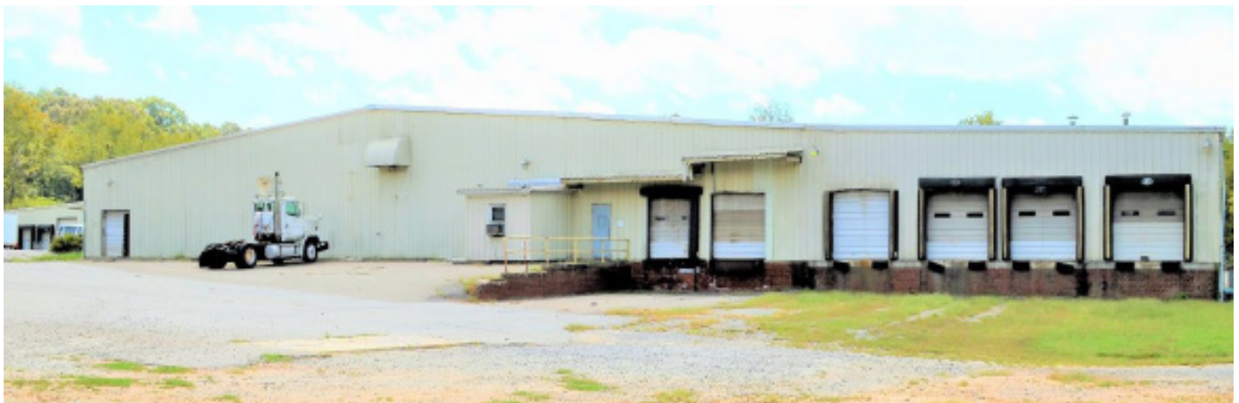
6 of 10 Loading Locks Depicted