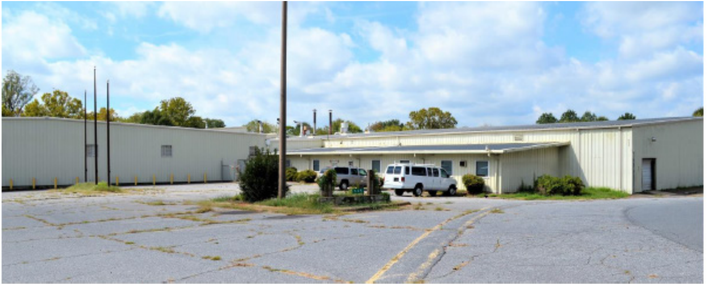
Main Office Area Entrance , Parking