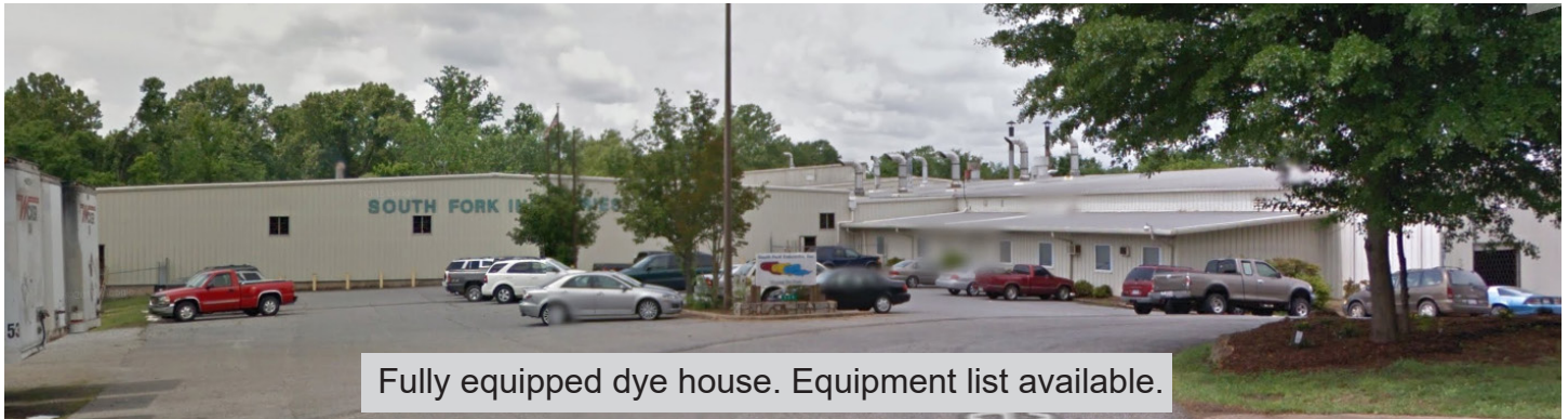
Fully equipped dye house. Equipment list available.