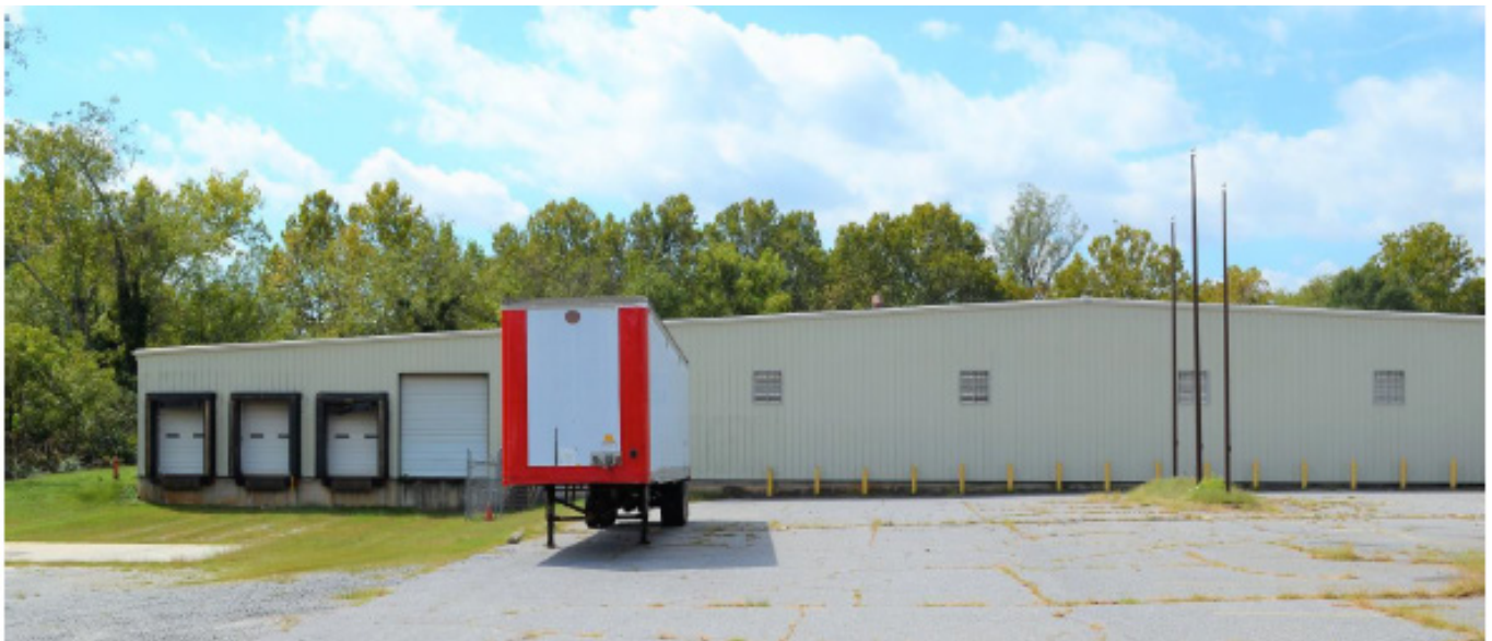
4 of 10 Loading Locks Depicted