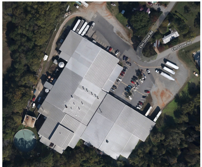
Aerial View of South Fork Industries Facility

Available: 41,775 sq. ft. and/or 65,625 sq. ft