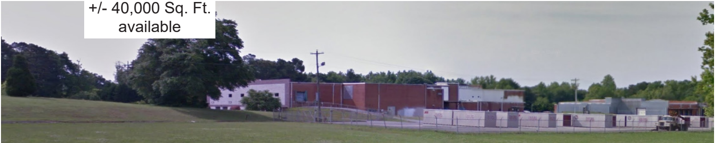
Lower Level Only