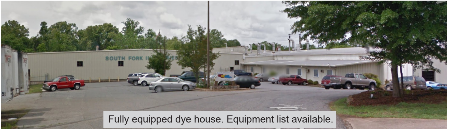
Fully equipped dye house. Equipment list available.