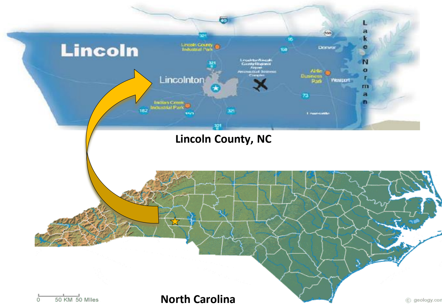
Lincoln County, NC