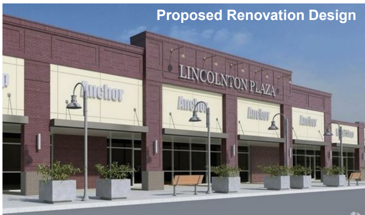
Proposed Renovation Design