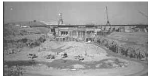
Cowan's Ford Dam Under Development