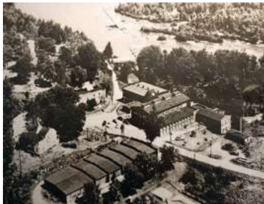
Cotton Mill Image: Long Island Cotton Mill